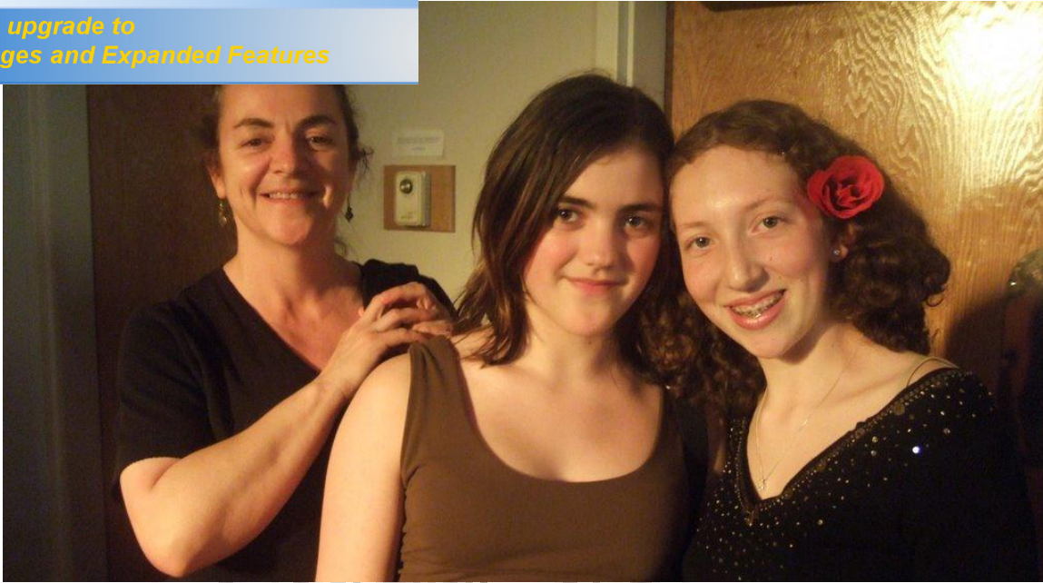
Ready for the show! Camp 2008