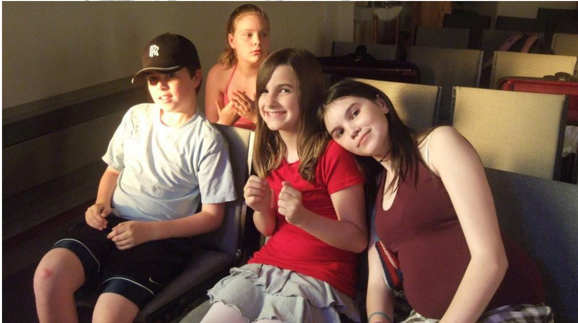
Hanging out with friends. Camp 2008