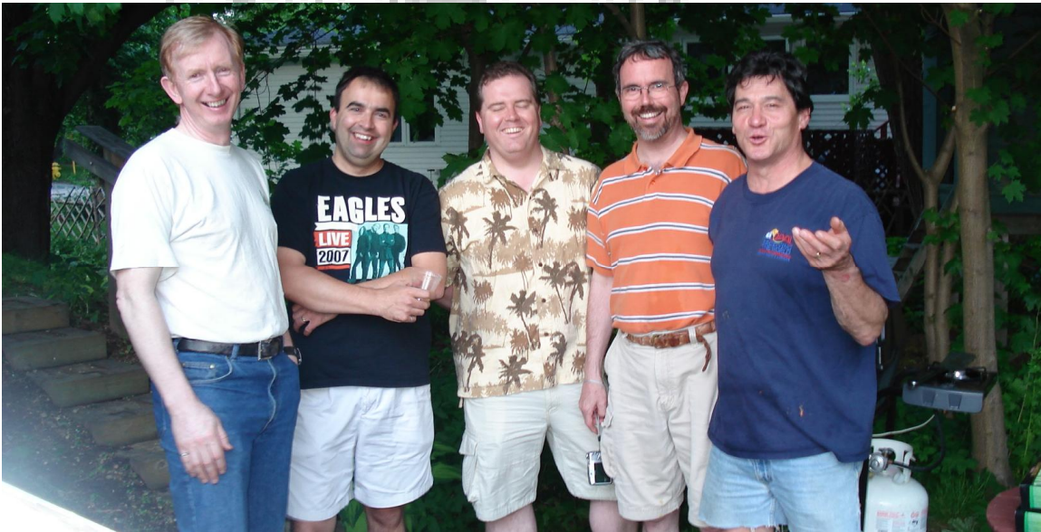
The gang in charge of the BBQ. Camp 2008