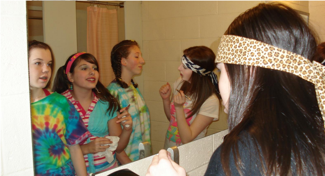
Getting ready for the big show!